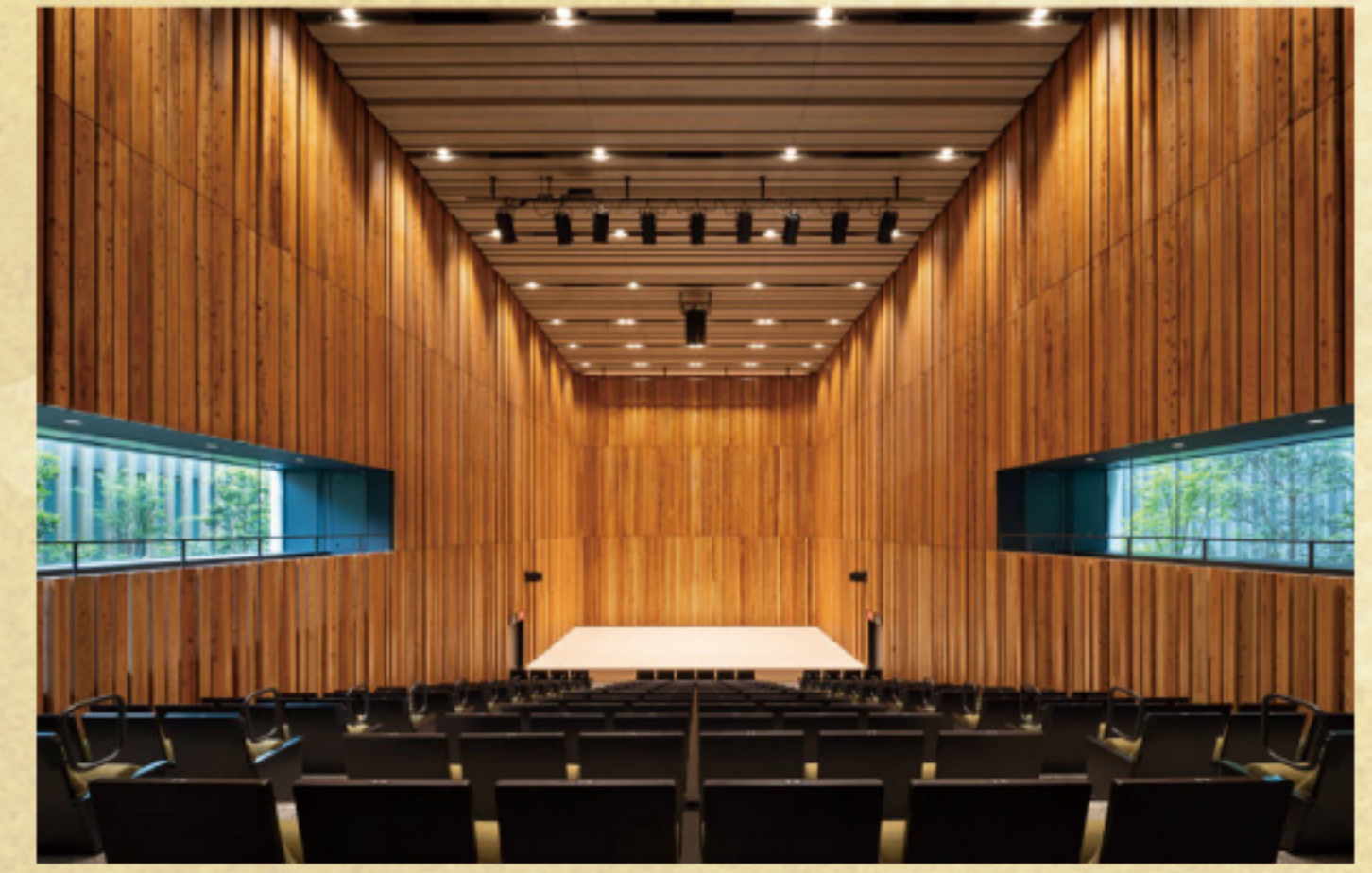
Taiyo Pharmatech Hall