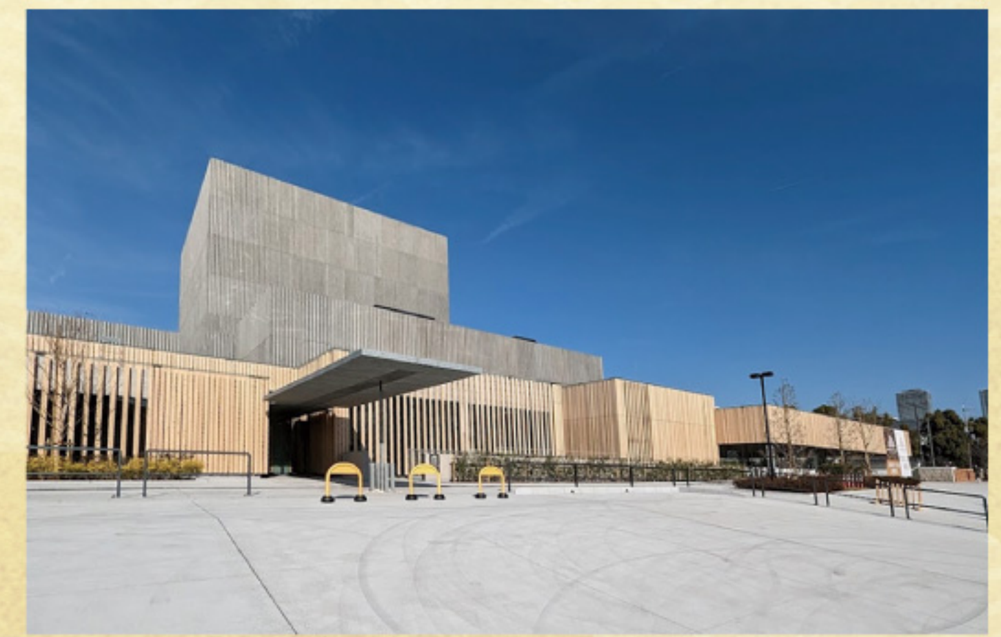
Takatsuki Arts Theatre South Wing